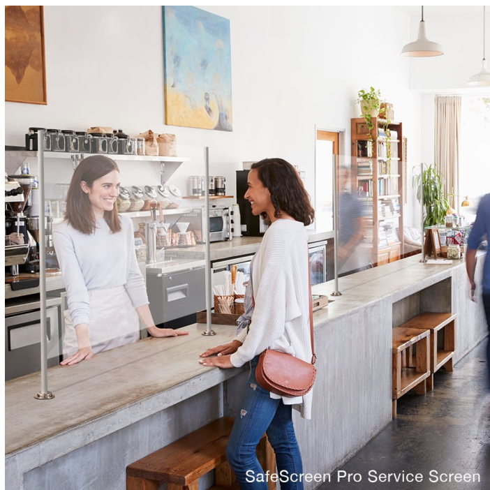
SafeScreen Pro Service Screen