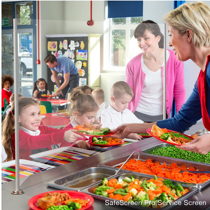
SafeScreen Pro Service Screen